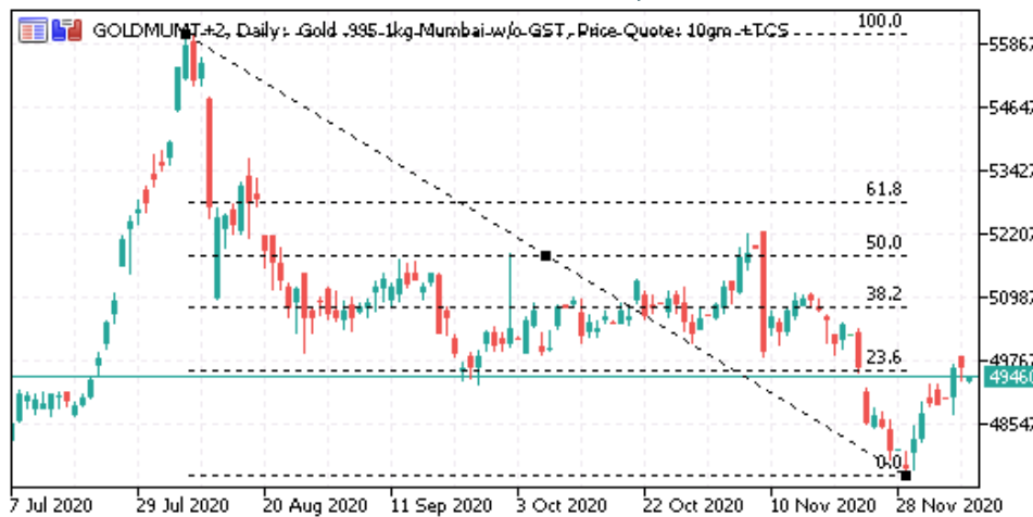
RSBL SPOT Gold (Mumbai) Daily Price Chart